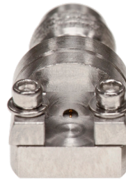
Narrow Profile ELF67-001