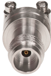
Common Interface ELF67