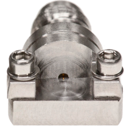
Standard Profile ELF67-002